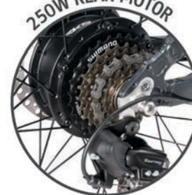
250W REAR MOTOR