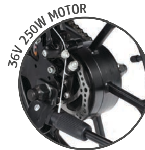
36V 250W MOTOR