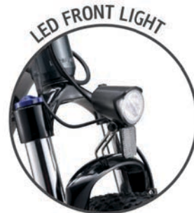
LED FRONT LIGHT