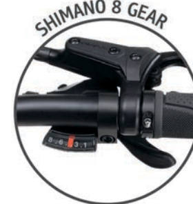
SHIMANO 8 GEAR