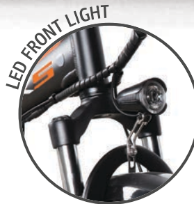
LED FRONT LIGHT