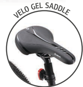
VELO GEL SADDLE

FRAME 27.5" ALLOY - BATTERY 36V 15 Ah (Samsung) - FRONT FORK SUSPENSION (LOCK-OUT) SADDLE GEL SPORT SELE - MAX SPEED 25 km/h - RANGE 65-80 km BRAKE HYDRAULIC BRAKE - TIRES KENDA 27.5" x 2.35- NET / MAX WEIGHT 23KG / 130KG RANGE OF THE E-BIKE DEPENDS CONDITION