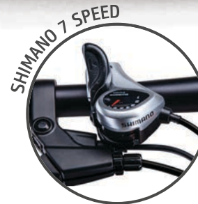
SHIMANO 7 SPEED