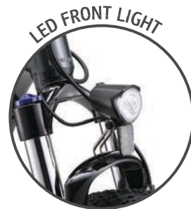
LED FRONT LIGHT