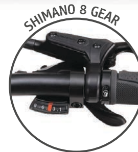
SHIMANO 8 GEAR