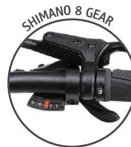
SHIMANO 8 GEAR