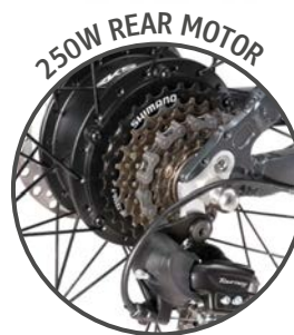
250W REAR MOTOR