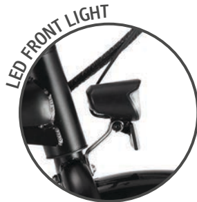
LED FRONT LIGHT