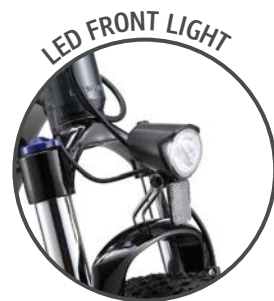
LED FRONT LIGHT