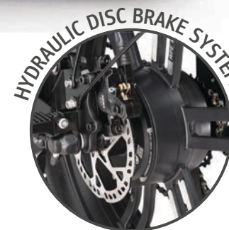
HYDRAULIC DISC BRAKE SYSTEM

FRAME 20" ALLOY - BATTERY 48V 14.5 Ah - FRONT FORK SUSPENSION (LOCK-OUT) SADDLE COMFORT DOUBLE SADDLE - MAX SPEED 25 km/h - BRAKE SYSTEM HYDRAULIC BRAKE SYSTEM RANGE 65-80 km - TIRES KENDA 20" x 4.5 - NET / MAX WEIGHT 38KG / 150KG