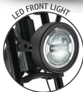
LED FRONT LIGHT