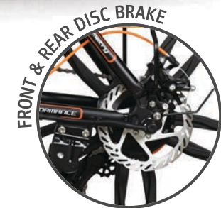
FRONT & REAR DISC BRAKE

FRAME ALLOY - BATTERY 36V 10 Ah - MOTOR 250W - FRONT FORK ALLOY LOCKED-OUT TOP SPEED 25 km/h - RANGE 45-60 km - TIRES CST 20" x 4.0 - NET / MAX. WEIGHT 24KG / 135KG RANGE OF THE E-BIKE DEPENDS CONDITION