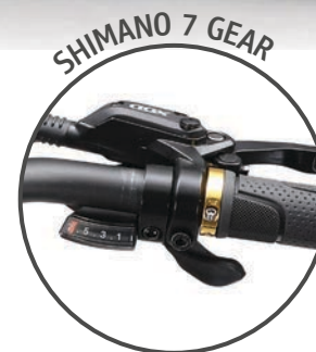
SHIMANO 7 GEAR