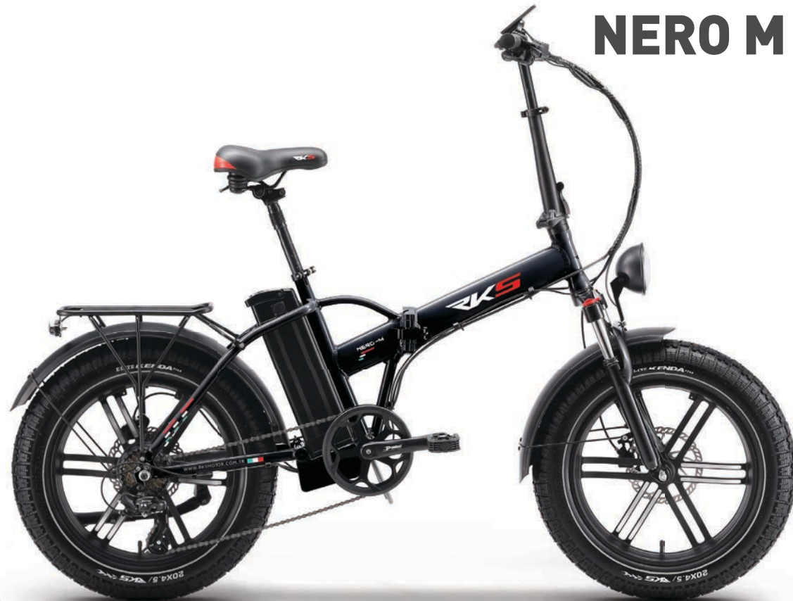
LED FRONT LIGHT