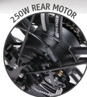
250W REAR MOTOR